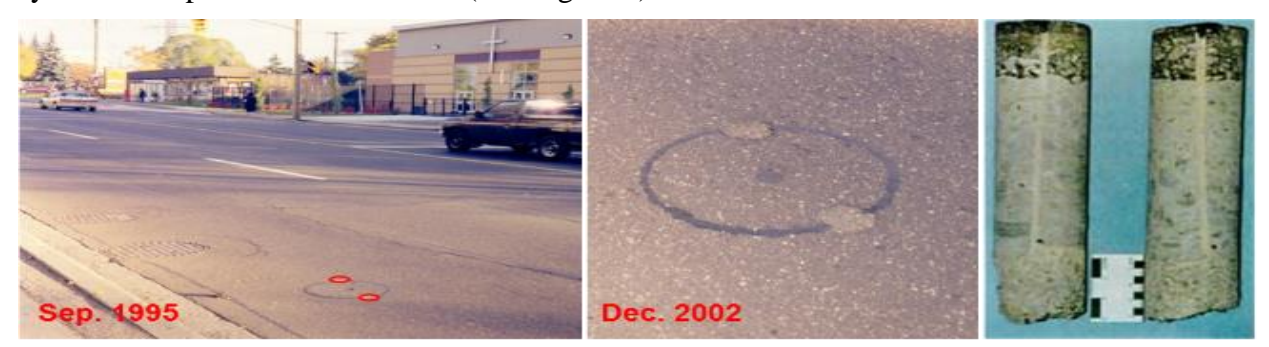
Long Term Performance through freeze-thaw cycles

bonding compound used to reinstate the core. Not only does it completely fill the annular space around the core, but when it hydrates it creates a mechanical, waterproof joint between the core and the remaining pavement. This restores the load bearing and transfer capacity of the pavement system to its pre-excavation levels (See Figure 7).