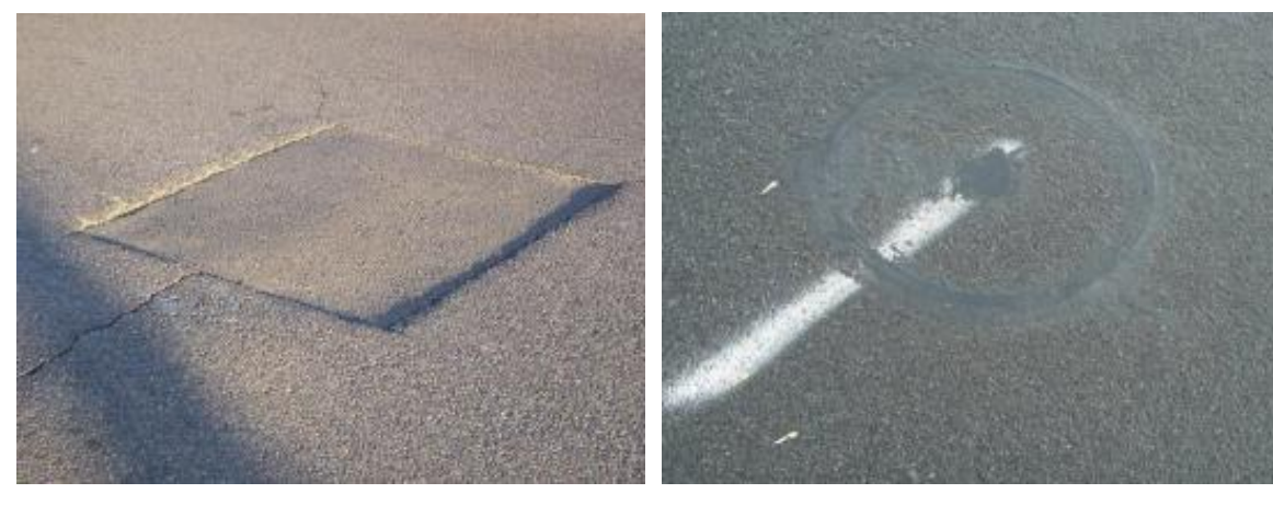
Figure 1. Traditional utility restoration

Once the inspection, installation, or repair work has been completed, if the excavation is not restored properly, the repaired pavement will settle (see Figure 1) relative to the original pavement or crack and allow groundwater to penetrate into the subgrade. The most common cause of pavement failures, subsidence and potholes is this groundwater.