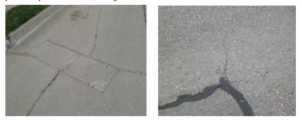
Figure 6. Pressure cracks emanating from the corners of traditional utility cuts

Even the geometry of conventional pavement excavations is suspect. The almost universal insistence by municipal authorities that utility excavations and repairs be rectangular in shape and formed with straight edges running parallel or at right angles to the traffic flow actually increases the likelihood of pavement failure. The rectangular shape of the conventional utility cut allows pressure from traffic to concentrate in the corners of the repair, by as much as 4 times as in the rest of the structure. This pressure can cause cracks in the corners of the pavement abutting the repaired section through which groundwater can penetrate into the subsoil leading to premature pavement failure (see Figure 6).