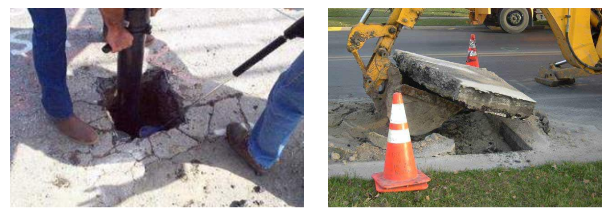
Figures 8 and 9. Damage around the utility cut caused by jackhammers and backhoes

How pavement cuts are made is also important. Jackhammers and backhoes disturb not only the neighbors as they chop through the pavement, but they also have a damaging effect on the base course, sub grade soils around and below the cut, as well as on the surrounding pavement itself. This affected area is called the 'zone of influence' and can extend out three feet beyond the actual cut (see Figures 8 and 9). The residual impact on the soils within this unexcavated zone significantly contributes to the decline in pavement life.