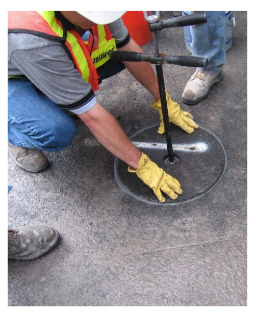
Figure 5. Pavement core being reinstated after the underground work has been completed,

Not only can the road be reopened sooner after the original excavation than with conventional restoration methods, but there is no need to subsequently shut down traffic again for the permanent pavement repairs. This results in a further reduction of road closure time of between two to three hours. In this way keyhole technology for pavement excavation and restoration can reduce the duration of this kind of utility cut repair by an average of three to four hours. If the process was