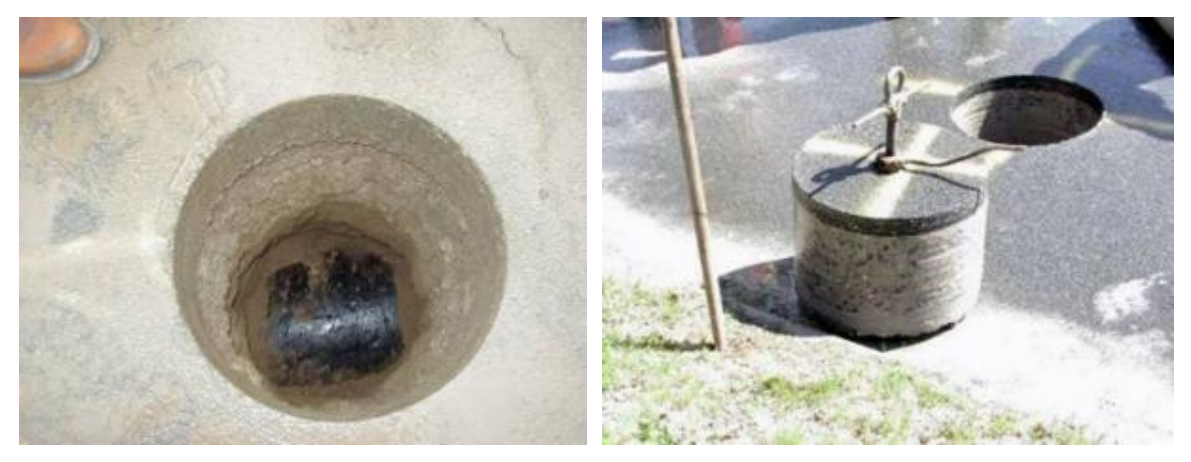
Figures 3 and 4. Pavement coring to expose underground utilities

Keyhole technology is a process of excavating a small, precisely controlled circular hole in the right-of-way to allow utility technicians to gain access to the buried infrastructure to install or repair it more safely from the surface using long handled tools. It can also be used to identify the exact location of buried utilities to avoid damaging them during horizontal directional drilling or boring, and as part of subsurface utility engineering (SUE) in the planning and design stages of highway construction.